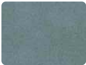
SHINE VELVET Light Blue