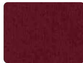
SHINE VELVET Bordeaux