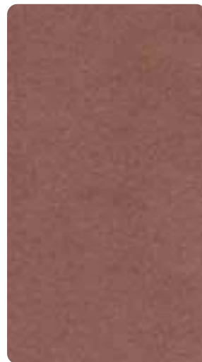
SHINE VELVET Mauve