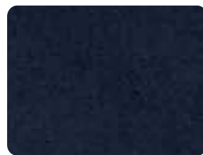
SHINE VELVET Indigo