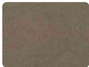
SHINE VELVET Taupe