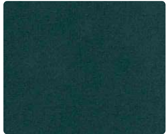
SHINE VELVET Ocean