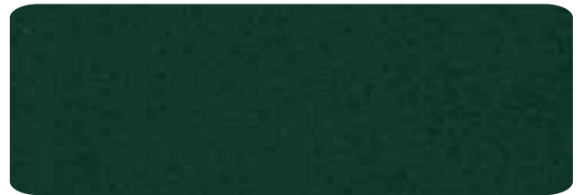
SHINE VELVET Bottle Green

• Type of fabric: velvet • Weight: 330 g/m 2 ± 10g/m 2 • Composition: 100% PES • Width: 140 cm ± 2 cm • Martindale Abrasion: 115 000 • Color Fastness to Light: 5 • Pilling: 4-5 • Color Fastness Test: dry 4-5 / wet 4-5