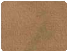
SHINE VELVET Gold